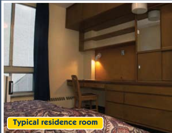
Typical residence room